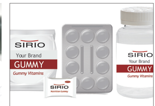
Packaging facilities on site