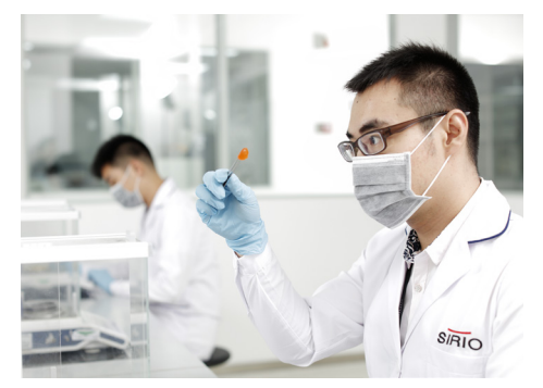
Class 100.000 GMP Cleanrooms